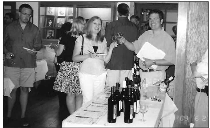
What a great turnout! The wine selections were outstanding and the knowledge gained on the wines... priceless.