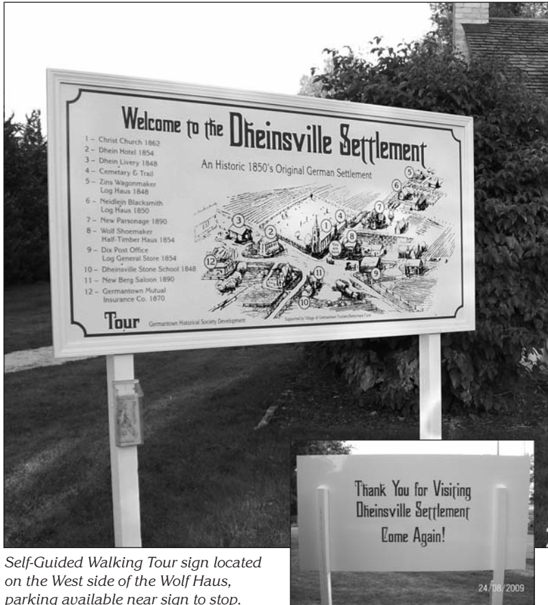
Self-Guided Walking Tour sign located on the West side of the Wolf Haus, parking available near sign to stop.

In honor of Founder's Day, August 22nd, our new Dheinsville Settlement Walking Tour Sign was installed just west of the Wolf Haus. There is an area there to pull up and park to view the sign! The first afternoon over 20 visitors stopped by to view it. The existing Dheinsville Park sign was moved to the fence on Holy Hill Road as our park does not have an official village park sign. This aids residents in finding us.