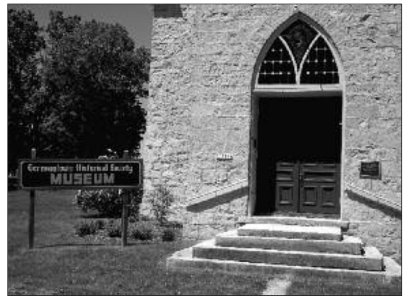
WE NEED YOUR PHOTOS! If you or a friend have any wedding photos that show the inside the Christ Church or any recollection of the colors or look of the interior, would you call us 628-3170 or stop in with your photos.

We have discussed how the wood cases would best be designed along with fabric panels, color and placement for best showcasing our historic treasures! We will need help moving some of our larger items from the back room over the Blacksmith's shop this spring. Call us if you are willing to help. Many hands make for light work.